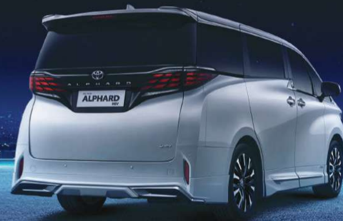
2.5 HEV Type*